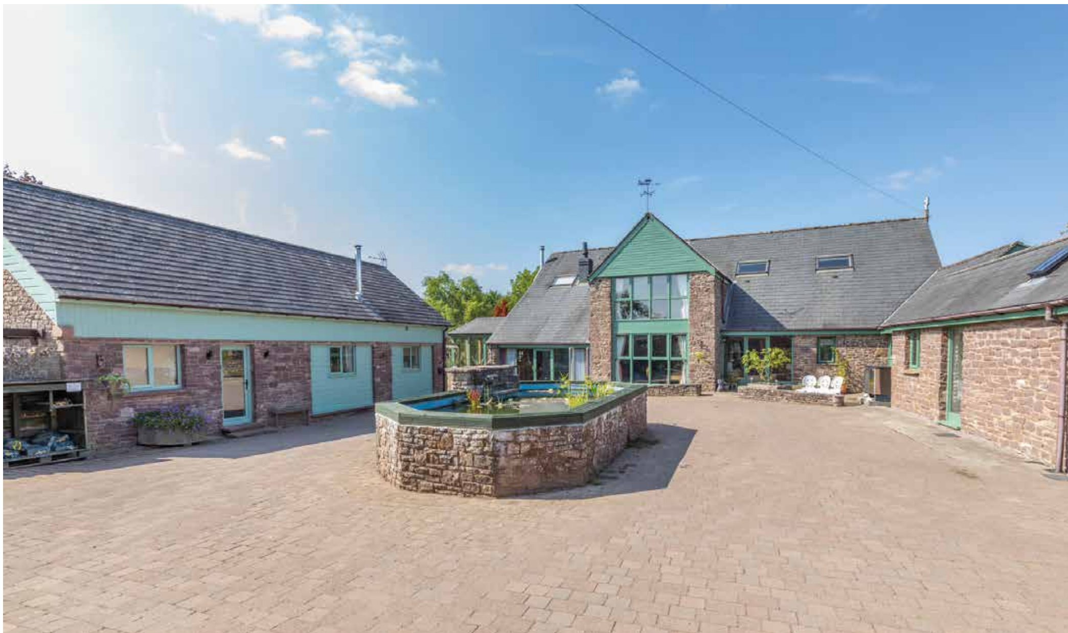
Beanhill Barn Alvington | Lydney | Gloucestershire | GL15 6AE