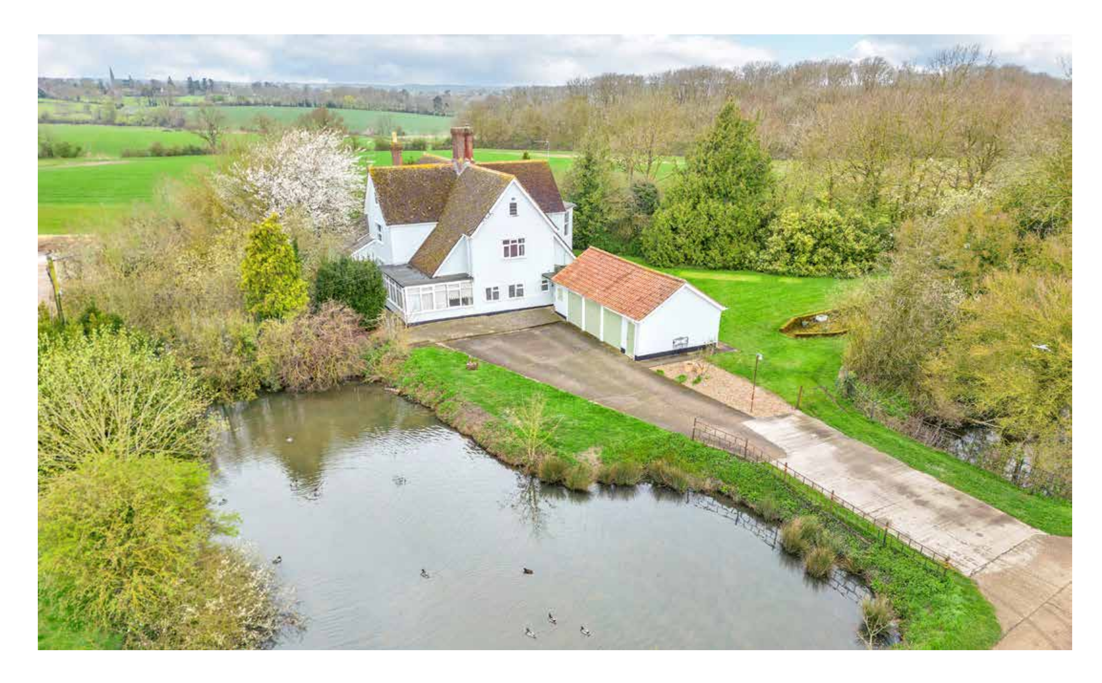
Boyton Hall Combs Lane | Stowmarket | Suffolk | IP14 3BL