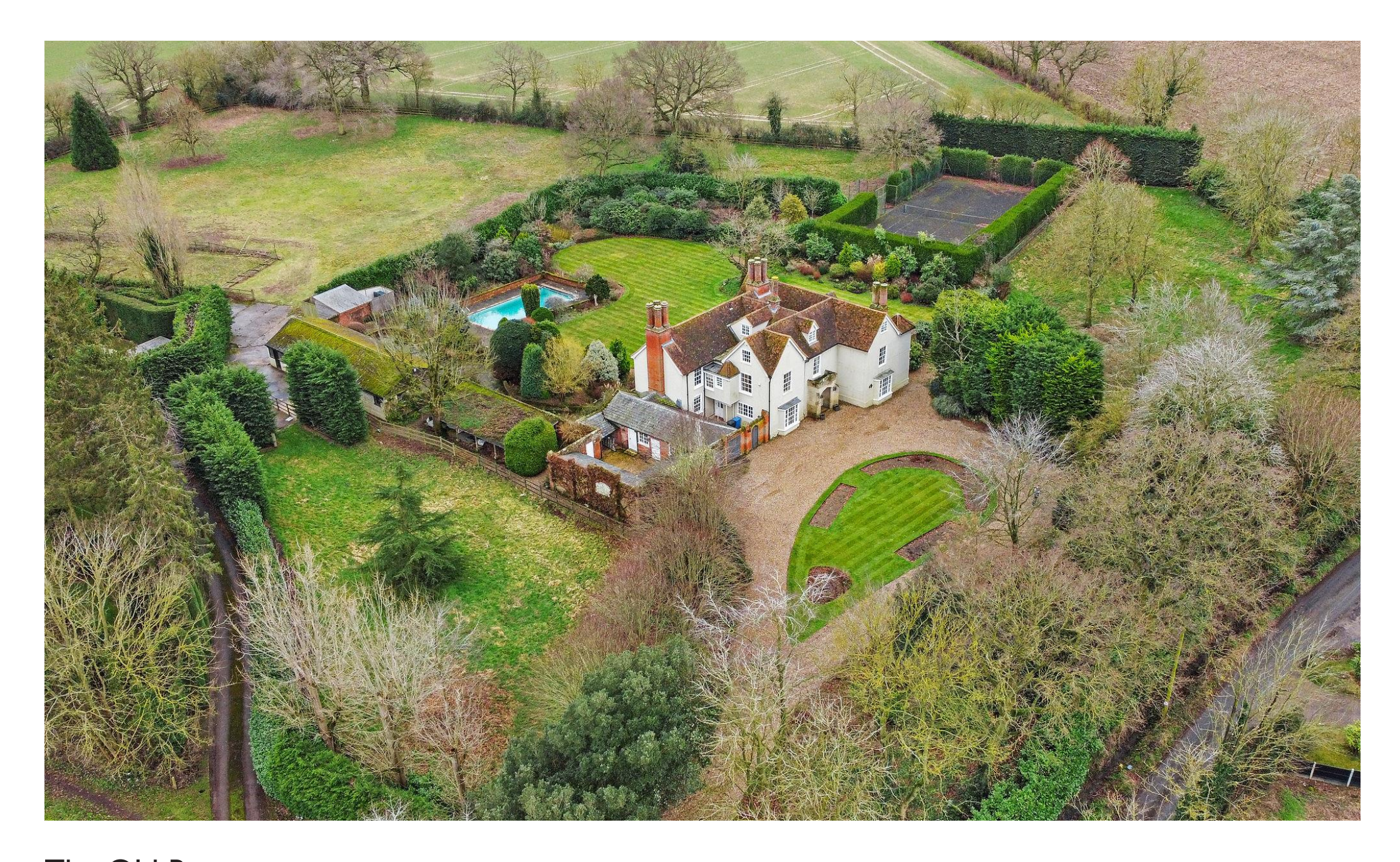
The Old Rectory Rectory Road | Newton | CO10 0RA